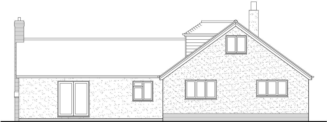
rear - north west