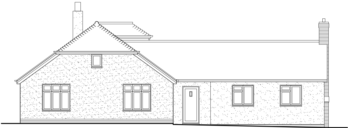
front - south east