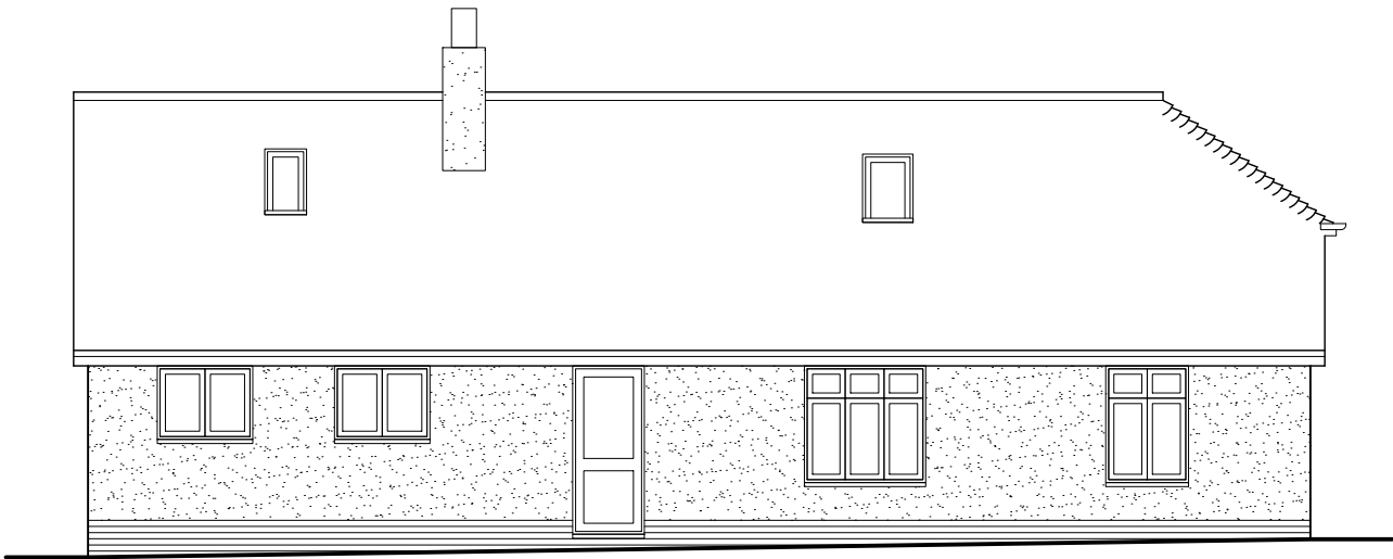
side - south west